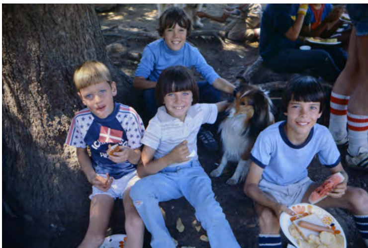
Five names here—who are they? All Texans! Bonus: year?!