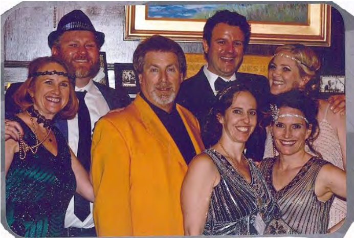
Seven (of nine) of The GG Board— having a great time at the Gala!