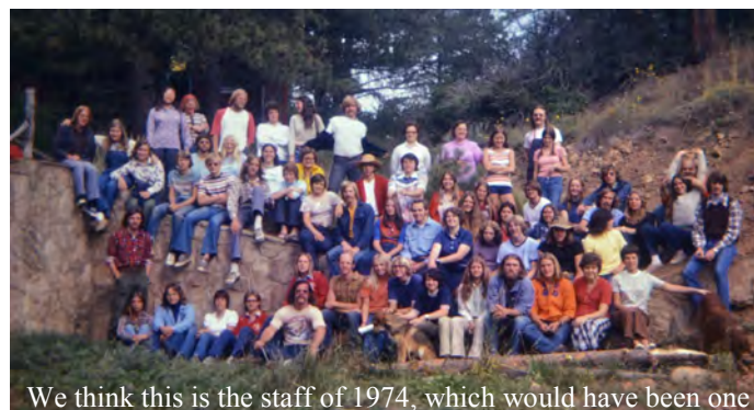
We think this is the staff of 1974, which would have been one year after the devastating fire that leveled our lodge, kitchen, and auditorium. Those were very hard summers.