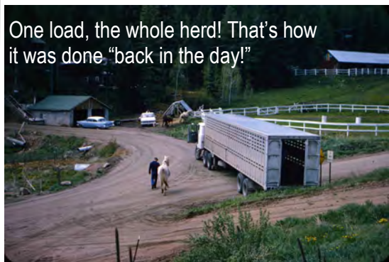
One load, the whole herd! That's how it was done "back in the day!"

Geneva Glen, the G / Herd, and I will be forever grateful to you,